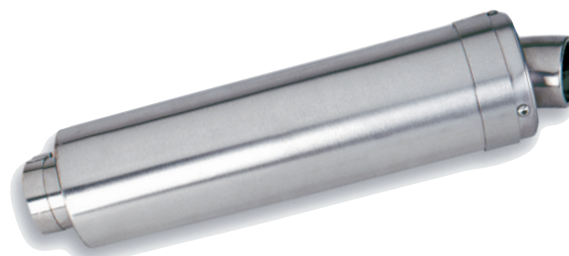
4" Internal Disc Slip-On

Complete systems come with Black headpipes.