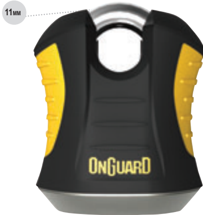
BEAST Pad Lock #5101 11mm (3/7") Shackle