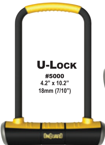
U-Lock #5000 4.2" x 10.2" 18mm (7/10")