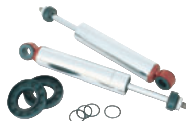
Damper Units Kit B