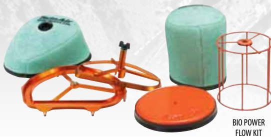
BIO POWER FLOW KIT