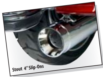
Stout 4" Slip-Ons