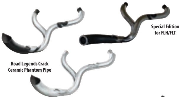
Road Legends Crack Ceramic Phantom Pipe