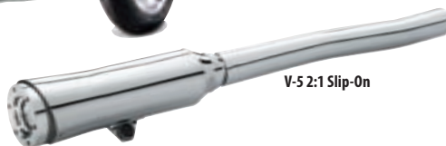
V-5 2:1 Slip-On