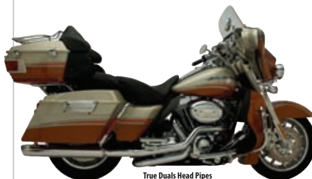
True Duals Head Pipes

FOR ALL APPLICATIONS *Requires '95 & up model Slip-Ons.+ 1 end cap required ++ 2 end caps required • Black head pipe Early model applications include 02 plugs. (Optional end caps are priced and sold seperately.)