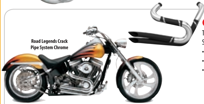
Road Legends Crack Pipe System Chrome