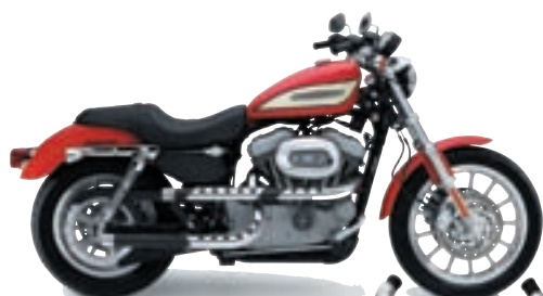
Road Legends Black Ceramic X Pipes