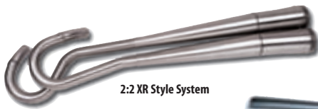
2:2 XR Style System