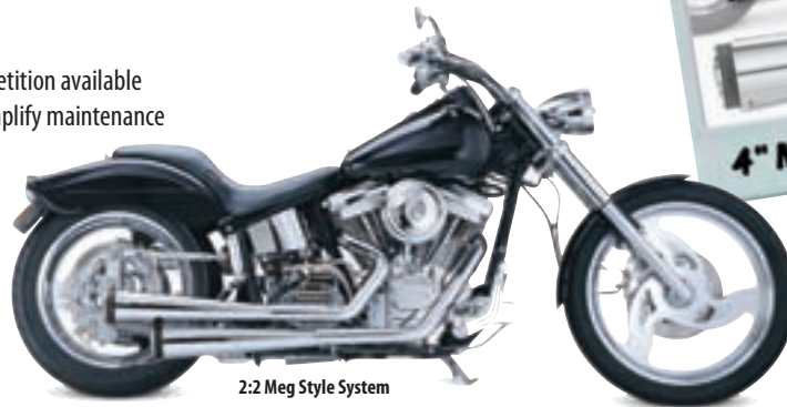
2:2 Meg Style System