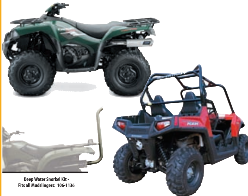
Deep Water Snorkel Kit - Fits all Mudslingers: 106-1136