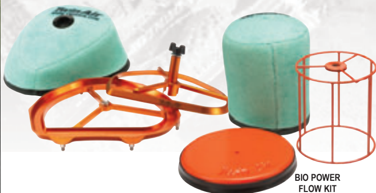
BIO POWER FLOW KIT